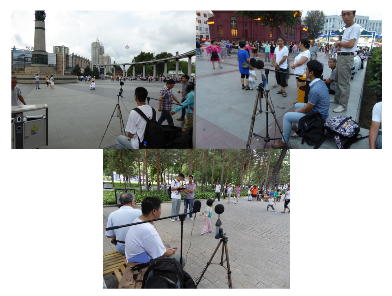
Figure 1 – Investigated sites in Harbin: Stalin park (top left), Citizen square (top right) and General park (bottom).

The survey and recording sites in Harbin were: Stalin park, Citizen square and General park (Figure 1). Recordings and surveys were conducted in Huludao in the following sites: in a square near the beach, in a populated part of the beach and in a less populated part of the beach (Figure 2).