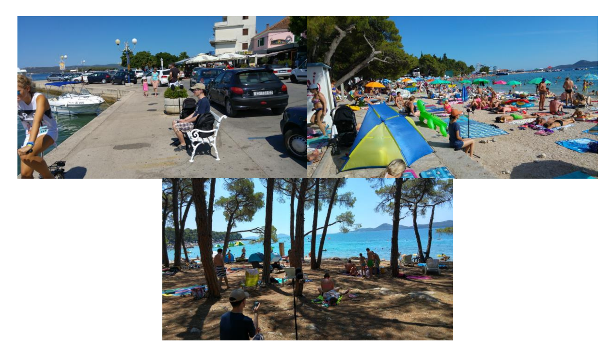
Figure 4 – Investigated sites in Biograd na moru: square near the beach (top left), populated part of the beach (top right) and less populated part of the beach (bottom).

Figure 3 – Investigated sites in Zagreb: Ban Jelacic square (top left), Cvjetni square (top right) and Bundek park (bottom).