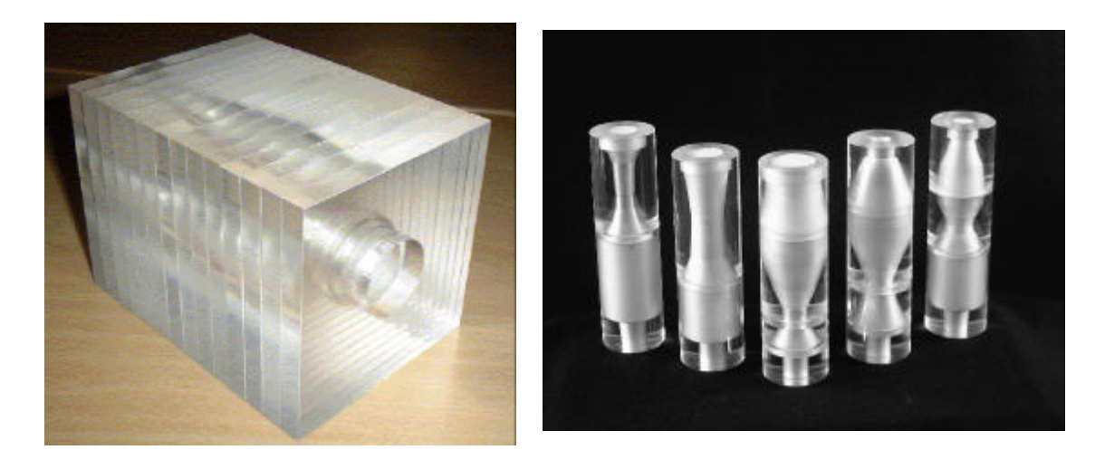
Fig. 3.- Two types of mechanical models of the human vocal-tract (from Arai, 2001 [10])

Fig. 3 shows two types of mechanical models of the human vocal tract: the plate model (on the left) and the cylinder model (on the right). The two models are made of acrylic resin because it is both transparent and easy to sculpt. For the plate model, each plate has a hole in the center so that when placed side-by-side the holes form an acoustic tube, the cross-sectional area of which changes in a step-wise fashion. For the cylinder model, the cavity forms a round bottle-shape, based on the measurements by Chiba and Kajiyama [4]. When the sound source is connected to one end of either of the models, a vowel-like sound is emitted from the other end.