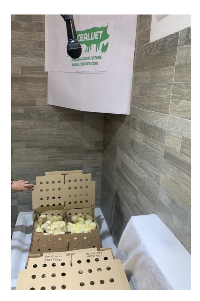
Figure 1 – Experiment setup for the recording campaign of the bird vocalisations.

In order to widen the acoustic study, a haematological analysis was conducted to verify whether the data obtained at blood level could support the results of the analysis of the acoustic recordings, and thus deduce the health conditions of the chicks. At 48 hours of age, the chicks were transferred to a blood extraction center, the Cesac, in Reus (Spain), and blood samples were sent to the Echevarne Laboratory, in Barcelona (Spain), where haematological parameters, like the haematocrit (HCT), the haemoglobin, and the count of the different types of leukocytes, were analysed.