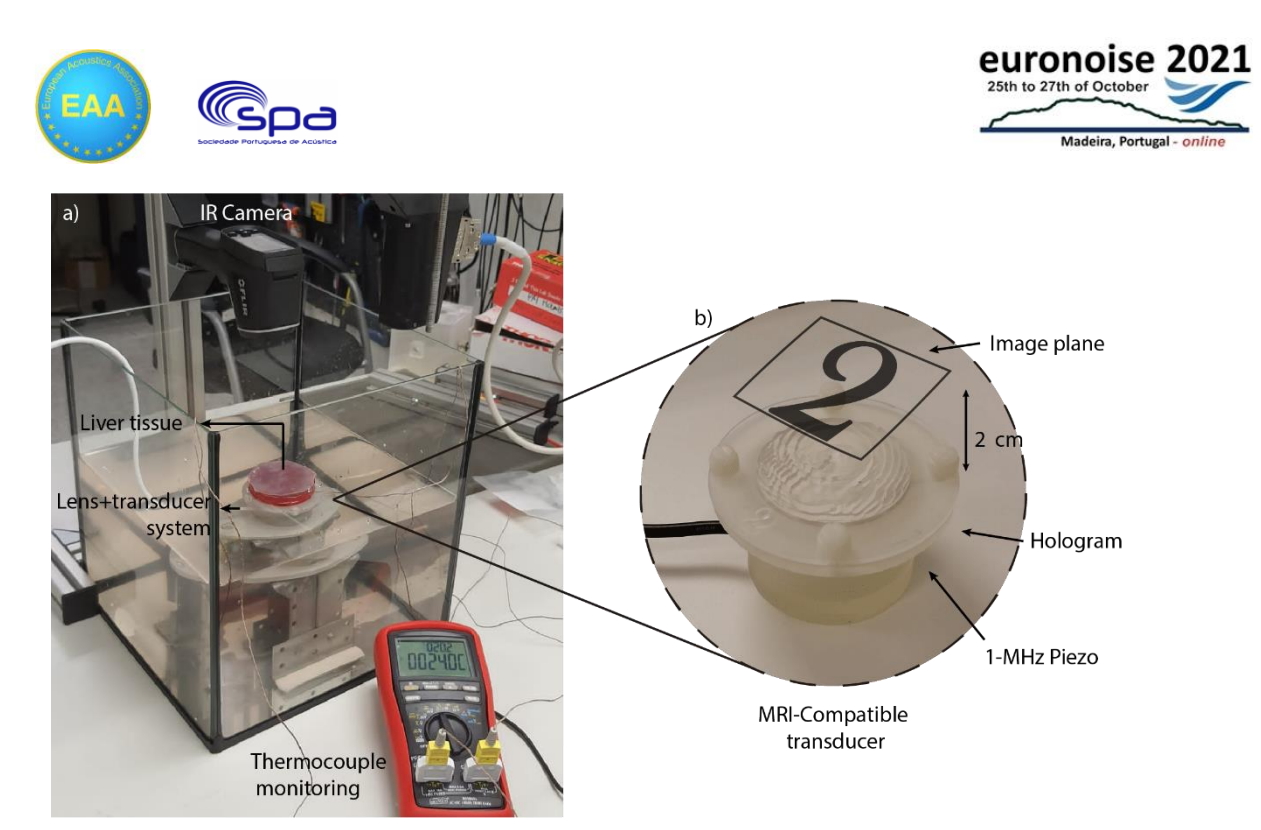
Figure 1: a) Experimental setup for thermal hologram validation using an infra-red thermal camera. b) Scheme of the employed lens-transducer system