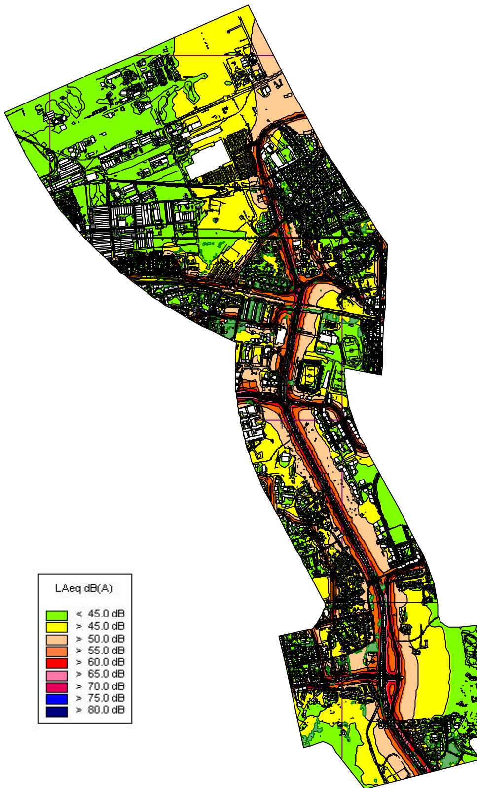
Fig 2. Noise map of the South Corridor, night time