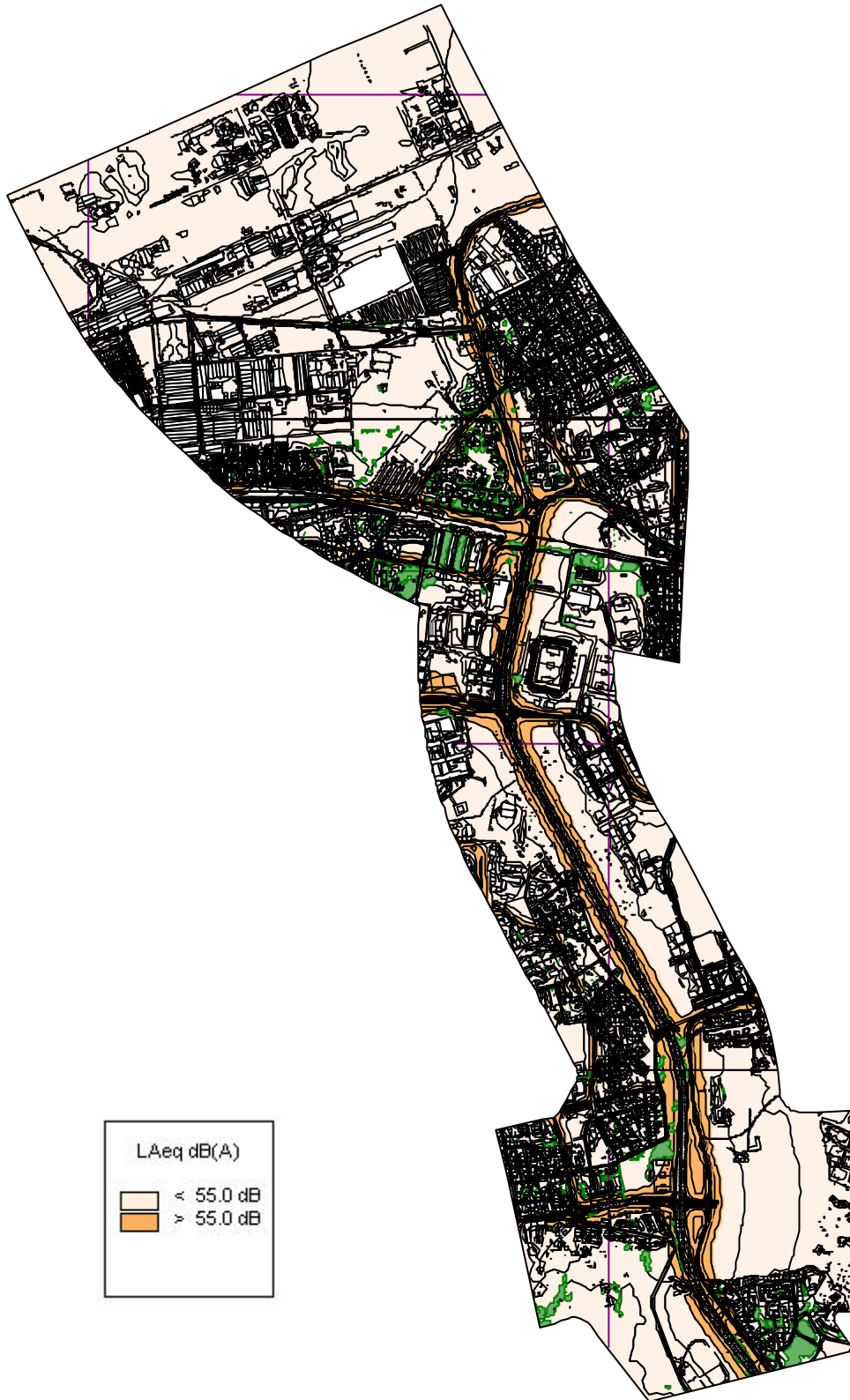
Fig. 3. Noise zones for the South Corridor, considering the 55 dB(A) limit, day time