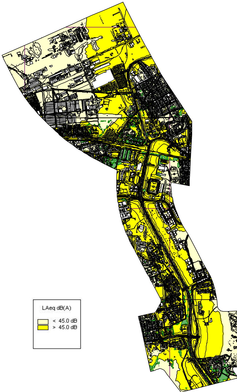
Fig. 4. Noise zones for the South Corridor, considering the 45 dB(A) limit, night time